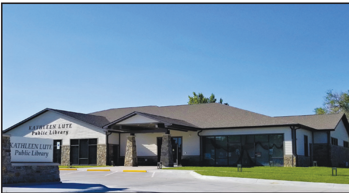
Kathleen Lute Public Library completed May 2020